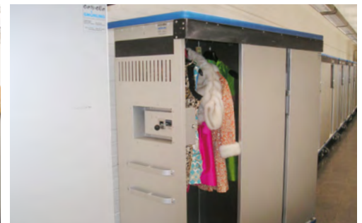
Costume cabinet trolley for opera, theatre & film with sliding doors