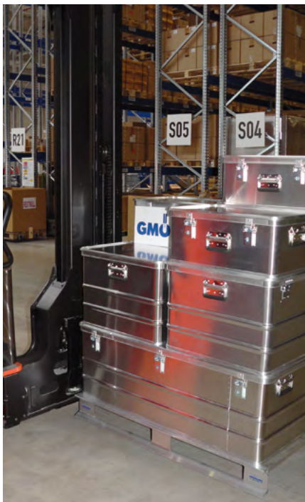
Boxes and pallets in high bay warehouse