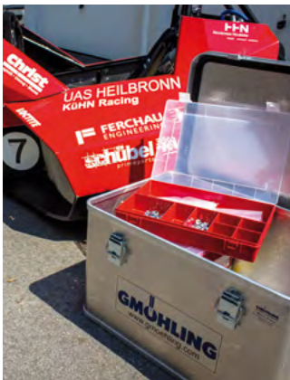
Toolbox for racing team

Gmöhling offers you a wide range of logistics solutions. Be it optimal use of storage capacities, the transport of goods or simple work cycles, we have the solution that goes hand-in-hand with your requirements, tailor-made, individual, innovative and time-saving in all cases.