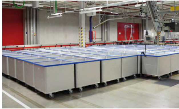
Spring-loaded base trolleys in consignment store