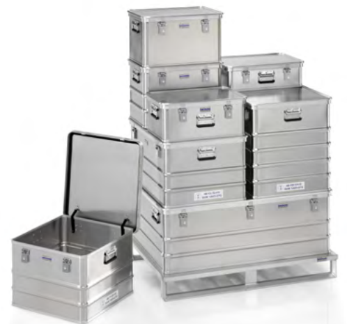
Hazardous goods packaging (ADR)