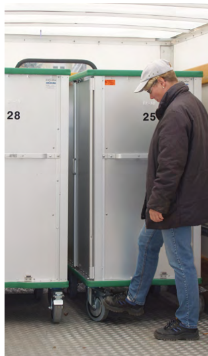
Cupboard trolley transport by truck