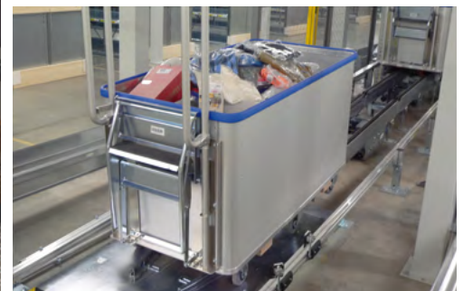
Order-picking trolley on a floor conveyor