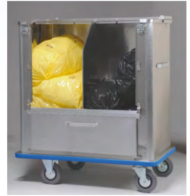
Waste collection trolley