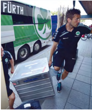
For sport teams