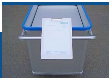
Writing board / clipboard