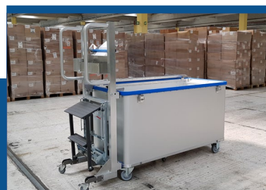
Ladder / pushing aid Beverage - scanner holder Label dispenser